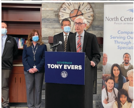
Governor Evers outline the new grant that will provide opportunities for increased community partnership and telehealth resources.